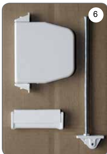
Outside rope box coiler, rope guide, rope grip [6].