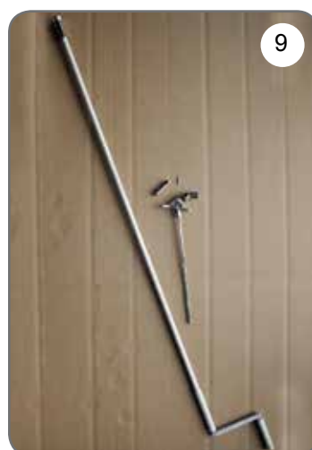
Handle, Cardan joint 45° or 90° with hook [9].