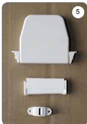
Outside strap box coiler, tabular strap guide, strap grip [5].

b) Types of applied, manual drives (options):