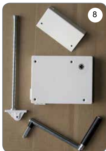
Winch for rope, angle for winch, rope guide, handle [8].