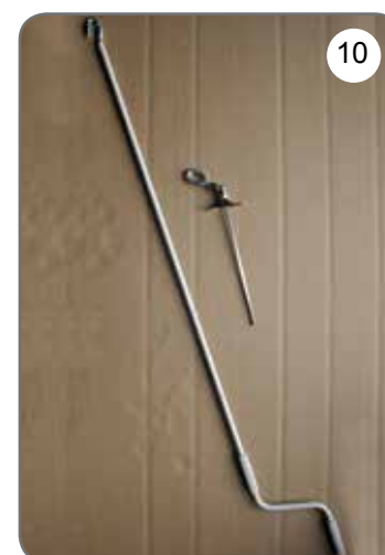
Handle, Cardan joint 45° or 90° with eye [10].