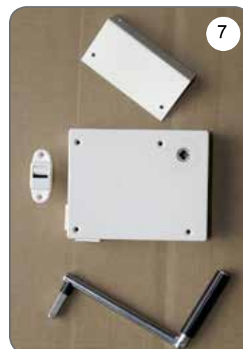
Winch for strap, angle for winch, strap guide, handle [7].